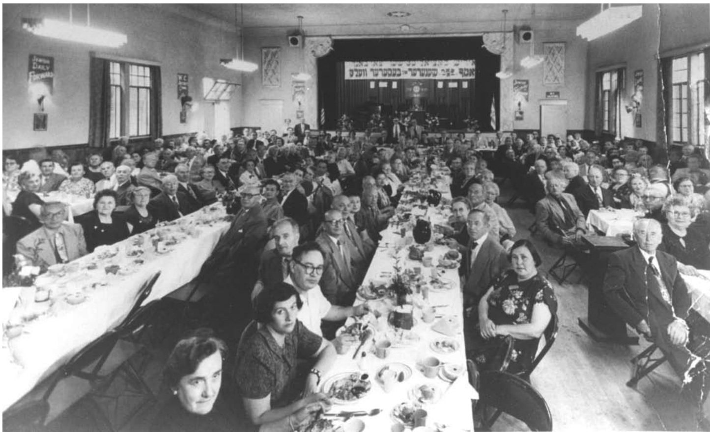
Banquet at the Vladeck Center in Boyle Heights. The two-story building served as a meeting place for the JLC, Jewish socialists, and the ILGWU.