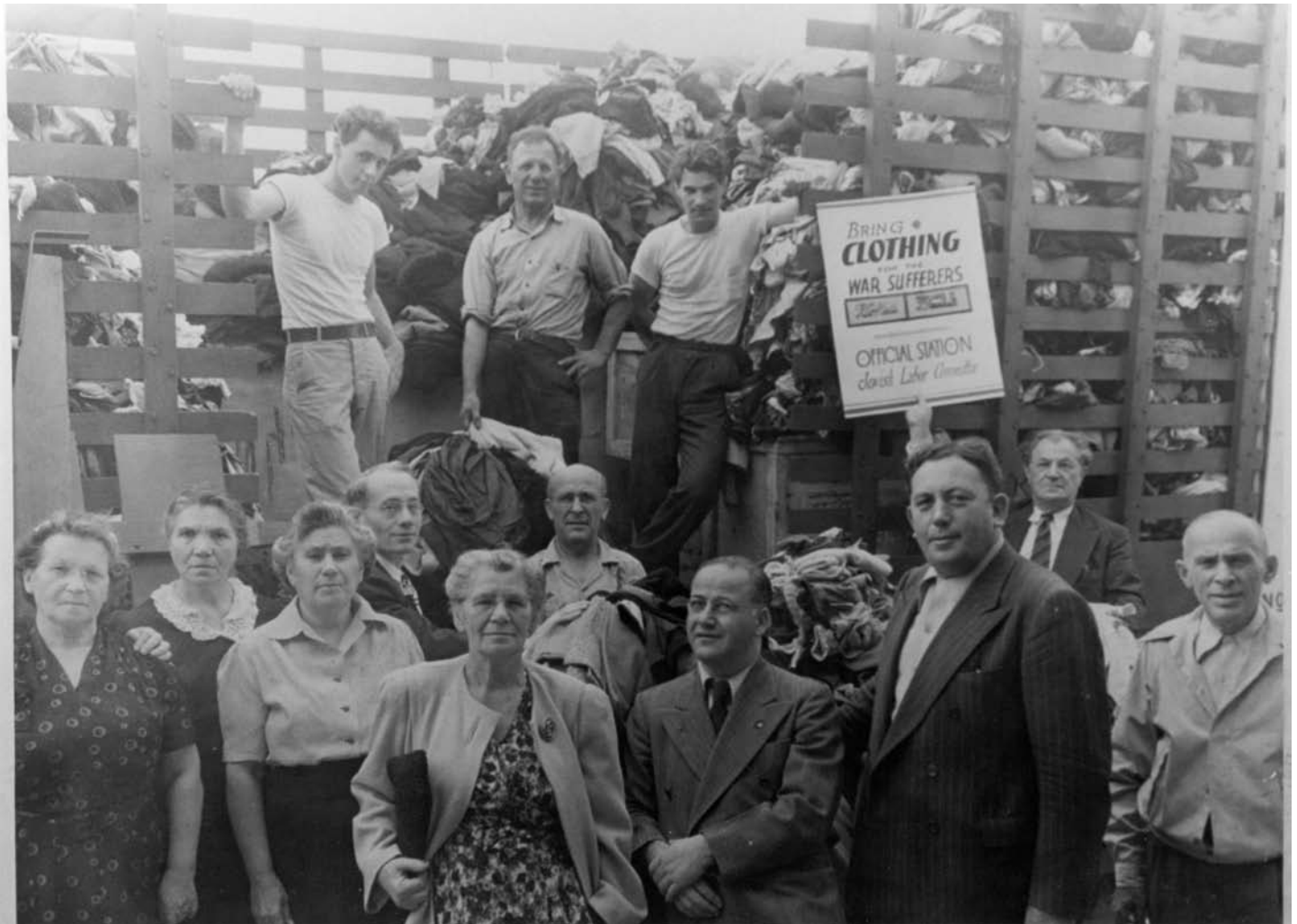
JLC volunteers in Boyle Heights collect winter cloths for Jews in Eastern Europe.